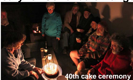
40th cake ceremony

Saturday evening saw a splendid curry spread, something that has been a hallmark of the CRC for many years and widely hypothesised as a key