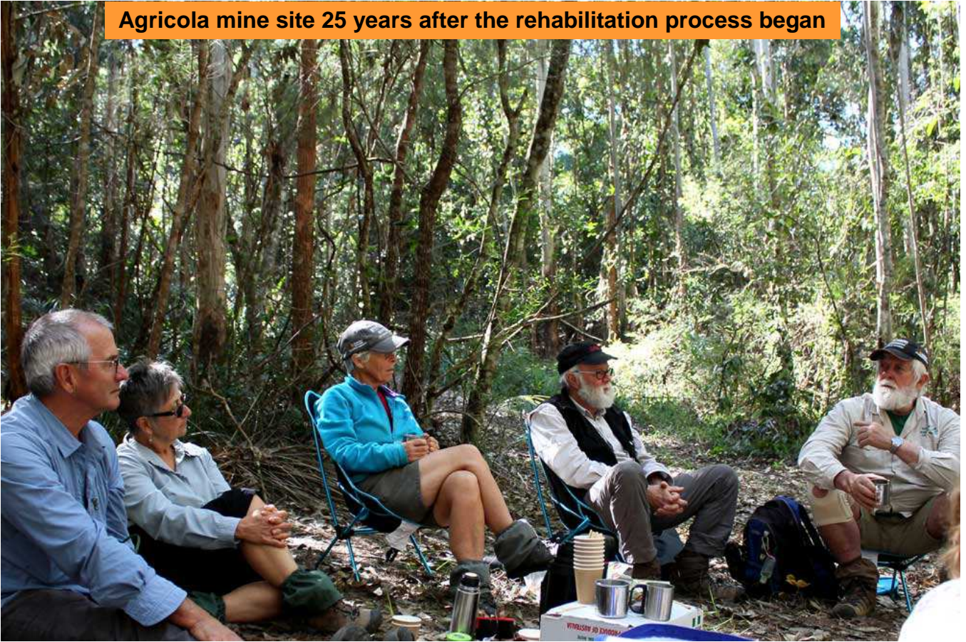
Agricola mine site 25 years after the rehabilitation process began

The Draft Queensland Protected Area Strategy closed for public comment on Friday 24 February. Will keep you informed on the outcomes.